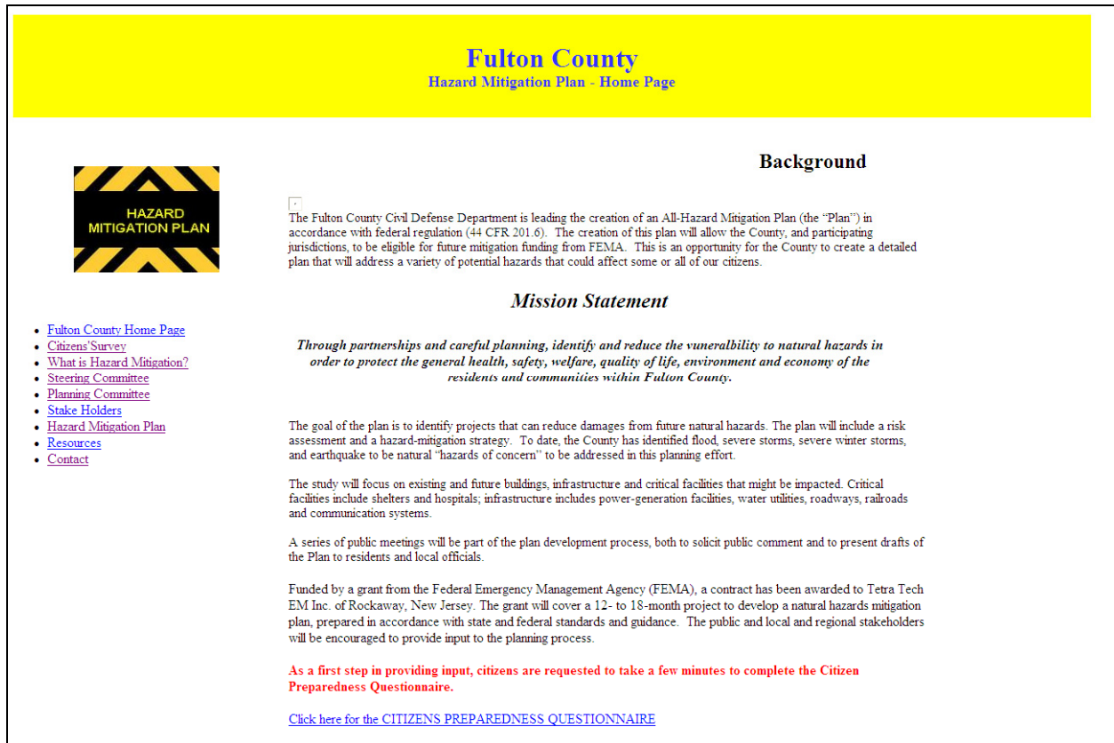
Figure 3-2. Screenshot of the Fulton County Hazard Mitigation Plan Public Website