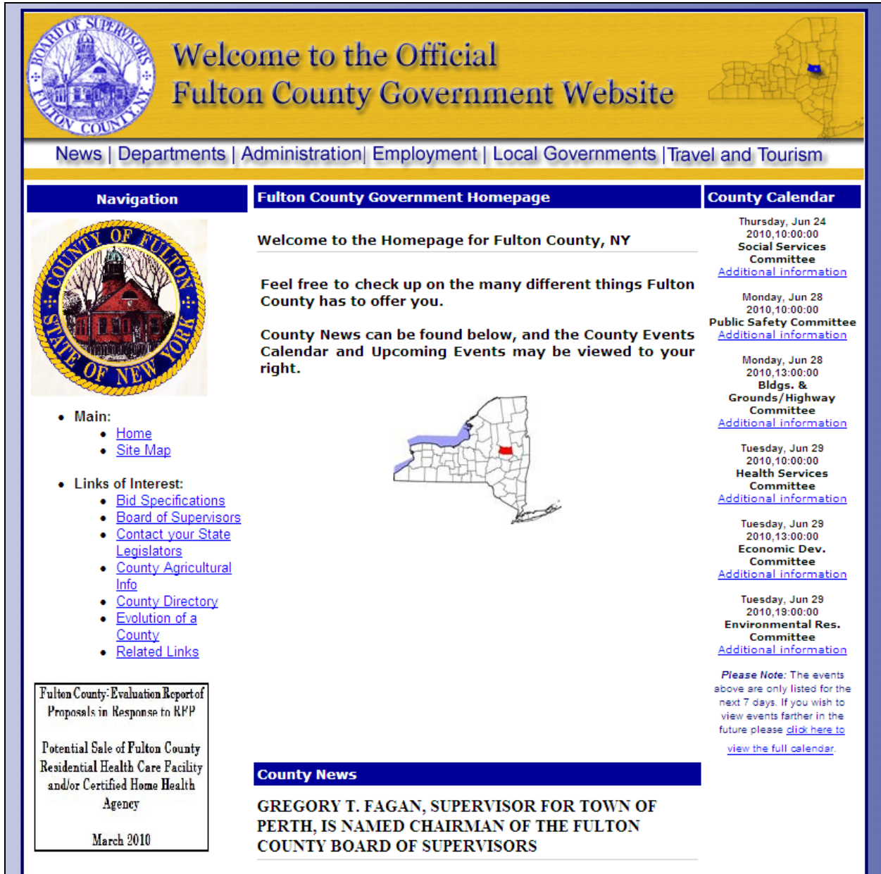
Figure 3-1. Screenshot of the Hazard Mitigation Plan Link on the Fulton County Government Website