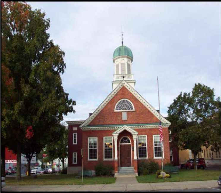
FULTON COUNTY COURT HOUSE