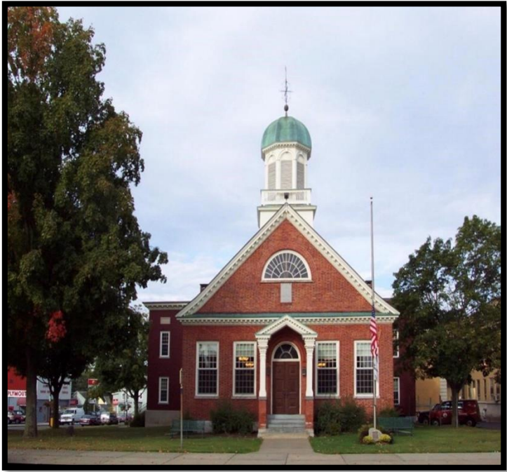
FULTON COUNTY COURT HOUSE